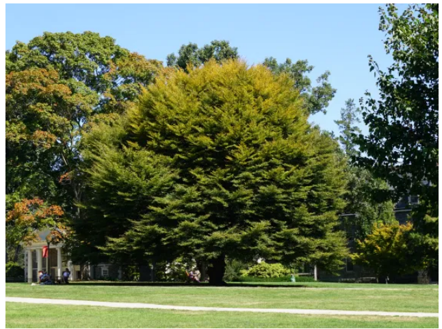
As Customs Folks, We're Going on Strike. Here's Why.