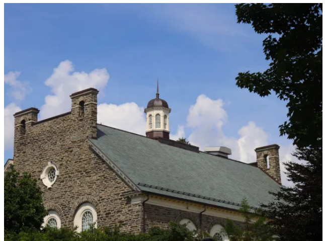
Haverford Is Failing Its Most Vulnerable Community Members