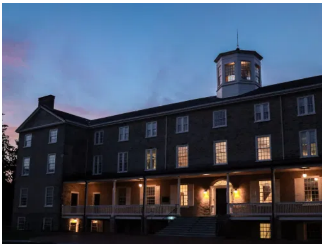
As Black Philadelphians Are Terrorized, I'm Ashamed of What Haverford Has to Say